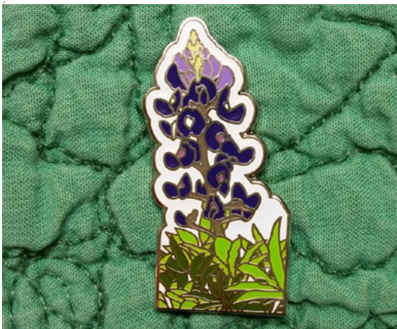
The 2015 Annual Recertification Pin