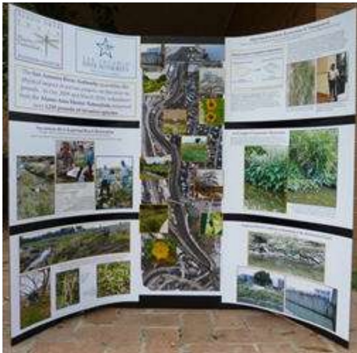
The completed Alamo Area Master Naturalist/SARA project display presented at the 2010 State TMN Conference with six panels and a large map of the area.

Master Naturalists are volunteers dedicated to the conservation, preservation and restoration of our natural resources, promoting ecological education for all ages.