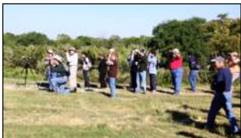
Does anyone see the bird?