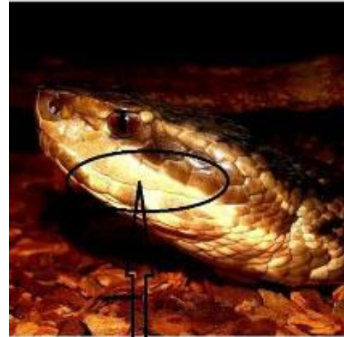
No Even Bars