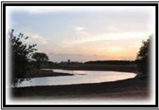
Evening scene at Seabourne Creek Nature Park

If you would like to help educate others and yourself, plus preserve and protect Texas' natural resources, then the Texas Master Naturalist™ program might be just right for you!