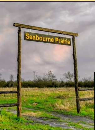
5 Prairie Restoration Area