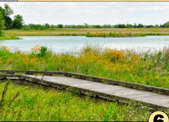
6 Wetlands Pond