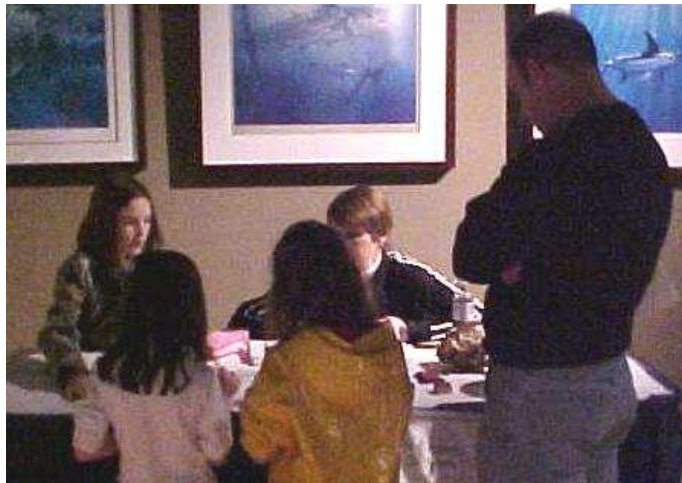
Texas Junior Master Gardeners Booth