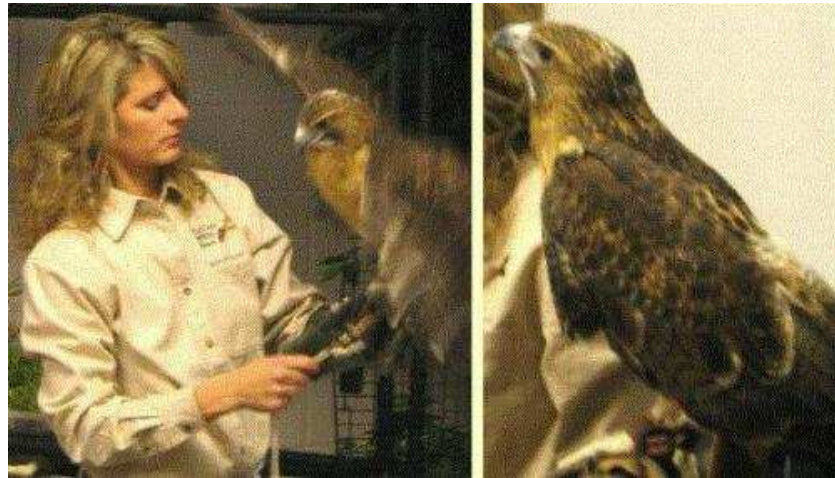
Red Shouldered Hawk