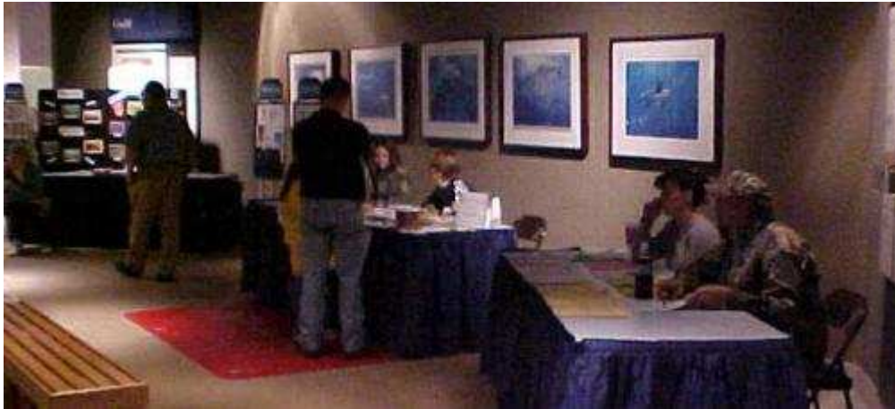
Three Booths The COT Chapter booth is on the left.