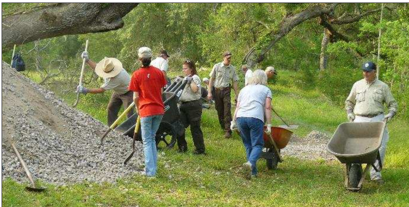
Hauling crushed concrete.