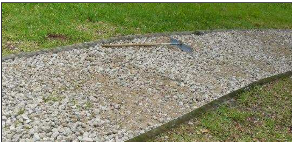
The Southeast Trail, under construction, May 8, 2010. Only the crushed concrete base course and the siderails had been installed when this photo was taken.

Work on this trail began with a bang (actually, lots of bangs) on May 8. Several volunteers from TMN-COT and FOBWR joined USFWS staff to place the siderails and the base course.