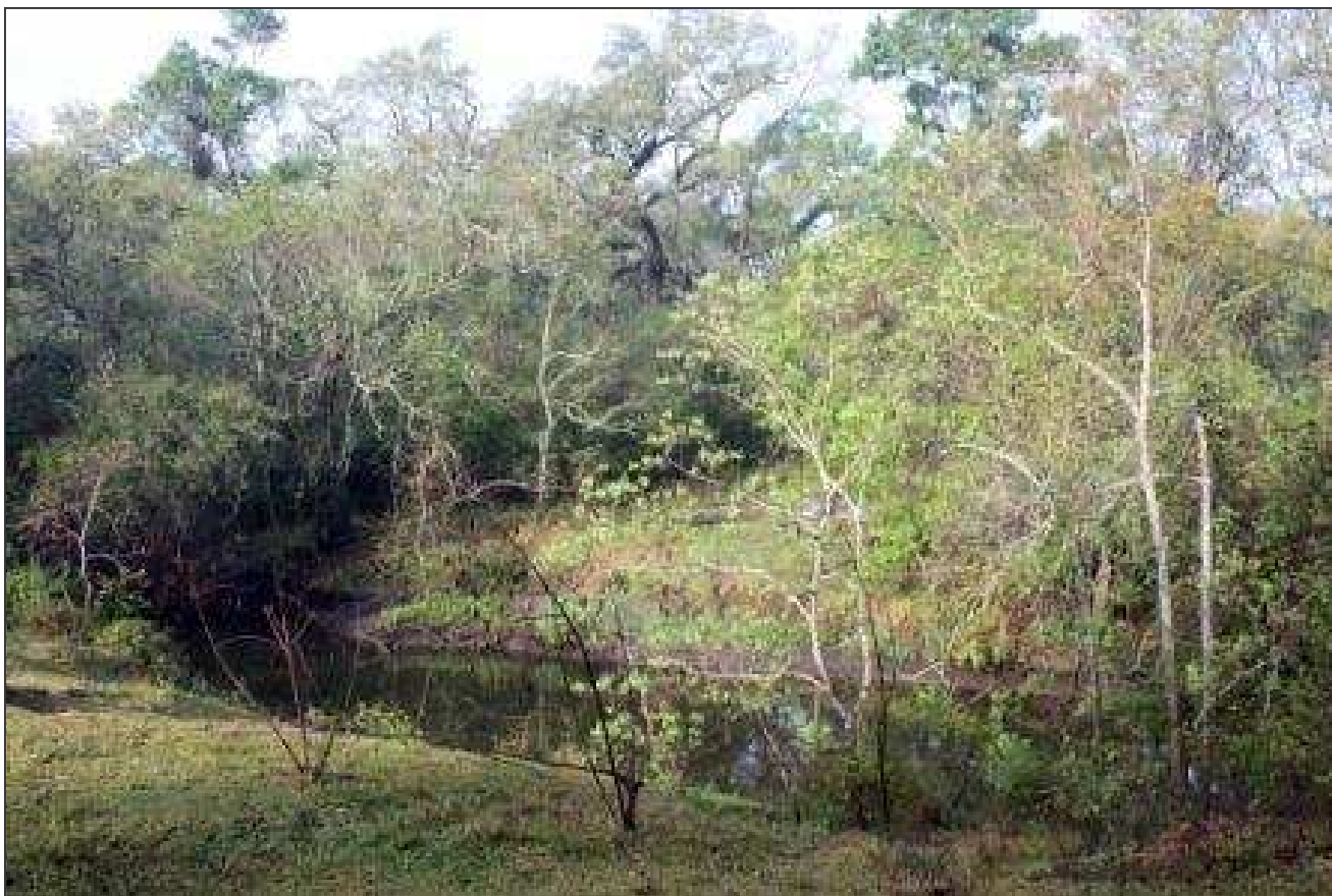
Bastrop Bayou.

Trails. We're currently working on two trails, the John Tveten Trail in the northeast part of the Unit and an as-yet-unnamed trail in the southeast part of the unit. Both trails meander along the eastern bank of Bastrop Bayou. The water is clear, and the views in several places are spectacular.