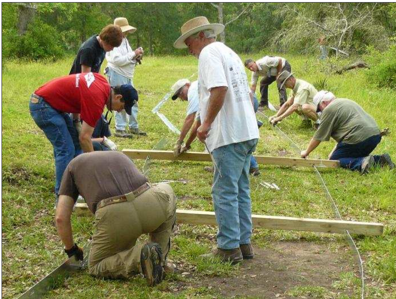
Setting the siderails

Photos from Southeast Trail Construction Day, May 8, 2010.