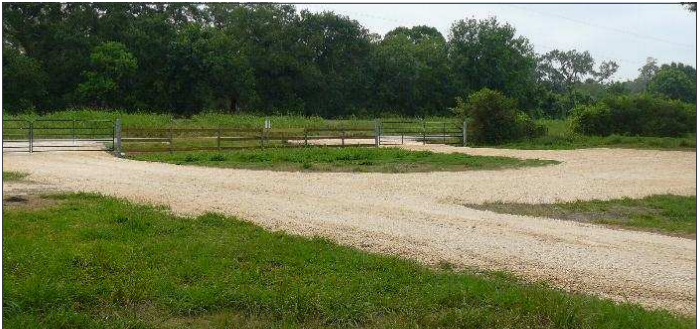
Dow Woods Parking lot, looking southeast. Note the two new entrance gates and the circular school bus driveway.

School Bus Entrance and Parking Lot. The original parking lot and gate were designed for relatively small vehicles — cars and pickup trucks — but they're too small for school busses. USFWS staff has installed two larger gates and a circular driveway so that busses can drive in and out without backing up. There will be parking space for three school buses.