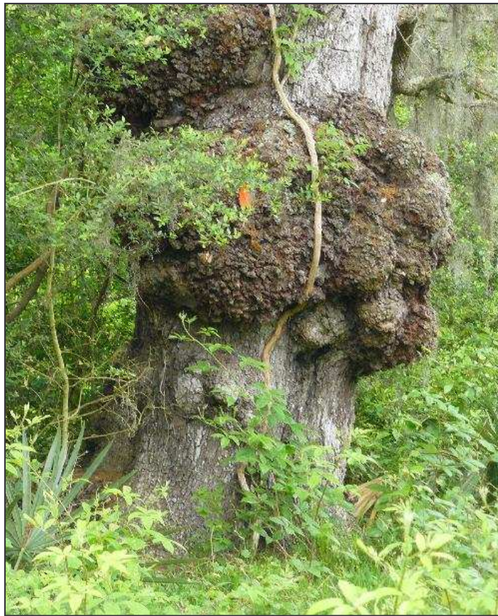
The “Burl Oak” along the John Tveten Trail.

Work of the southeast trail has already begun. This trail will have a crushed granite surface over a crushed concrete base, with steel siderails to prevent the crushed material from eroding. Like the Tveten Trail, the southeast trail will be six feet wide.