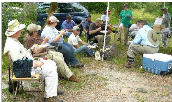
The well fed personnel