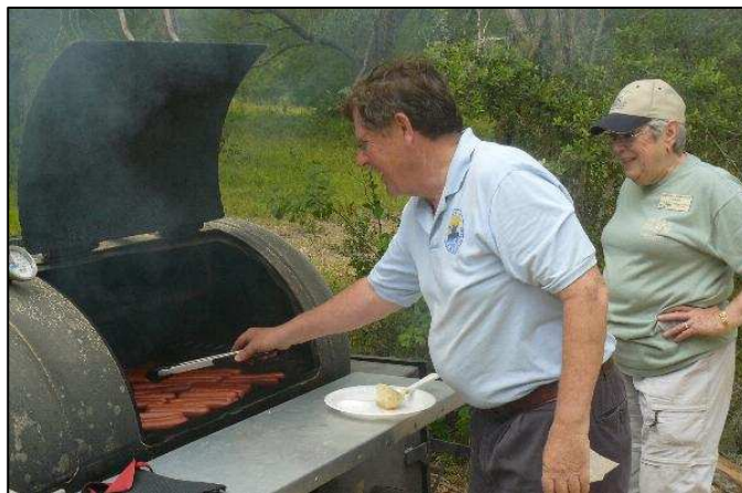
Chief Chef and Sous Chef