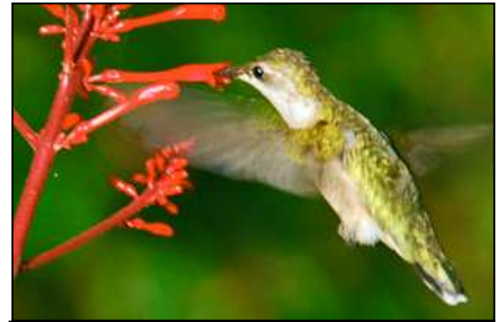
Ruby-throated Hummingbird female Archilochus colubris Brazoria County, 2008

Come on out and watch the banding, adopt a hummingbird, browse the Nature Store, walk the nature trails, or buy a plant to attract hummingbirds and butterflies.