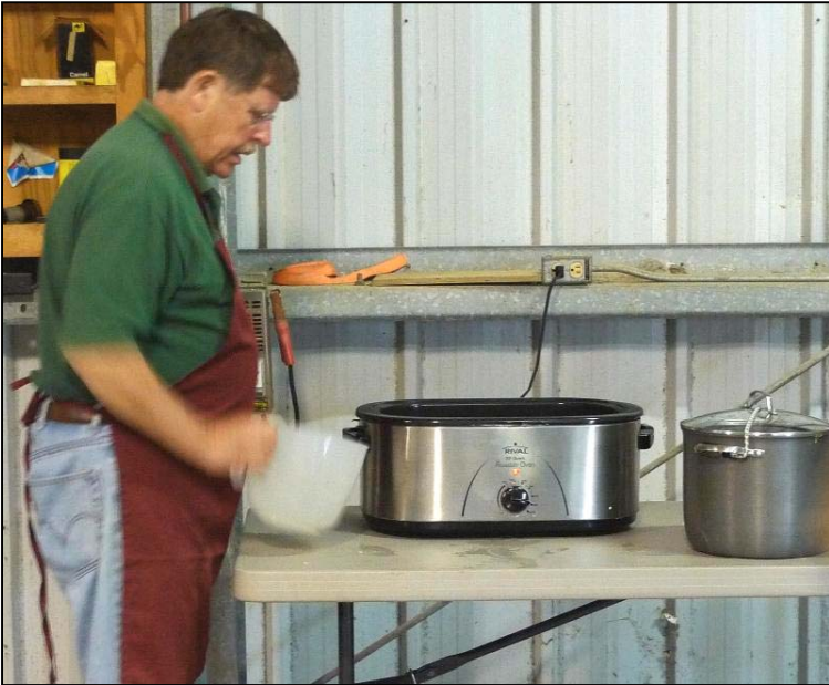
Now what was I going to put in here???