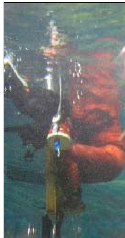
"Laying his finger aside of his nose, giving a nod, up the chimney he rose."

More photos of Sandy Claws' visit are at bit.ly/SandyClaws_2011