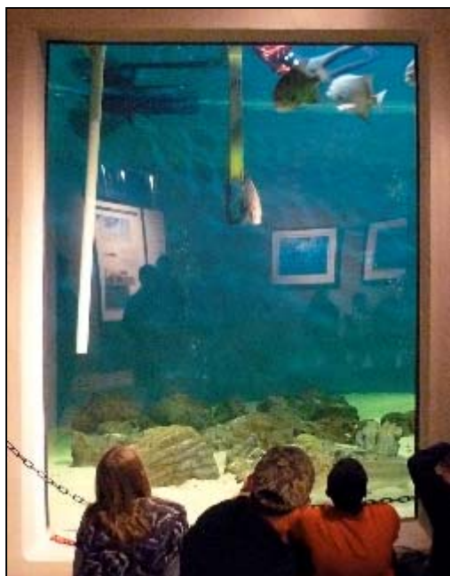
Look! You can see Sandy's boots up there. He's coming down the chimney!