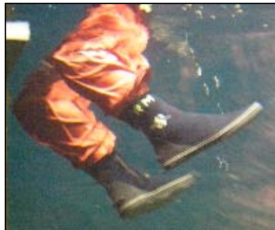
Visitors were delighted at the first sight of Sandy's boots as he descended the chimney.