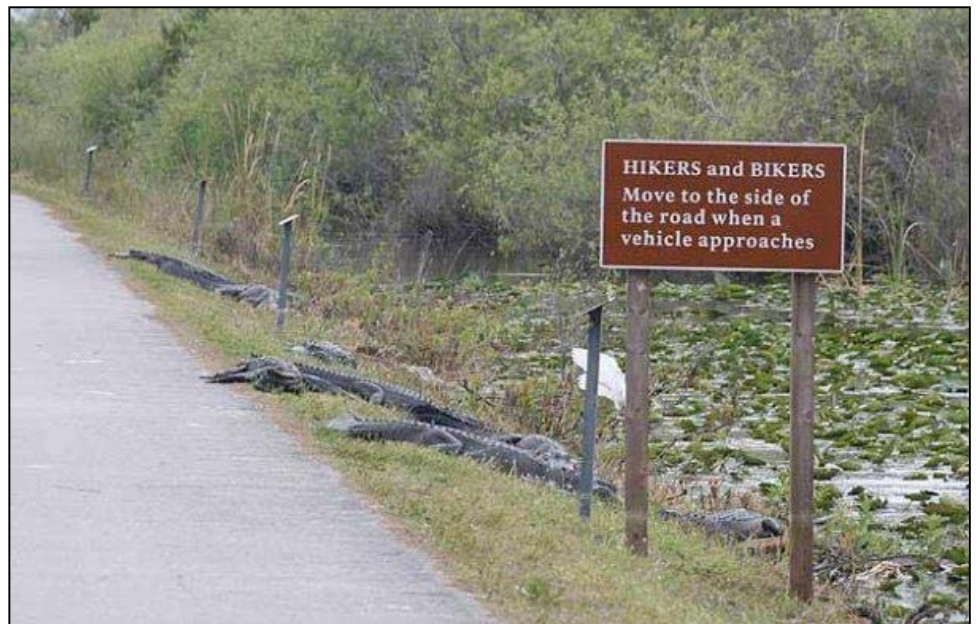
"HIKERS and BIKERS Move to the side of the road when a vehicle approaches"