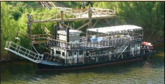
Above: The Brazos Belle at its home dock on the Brazos River near the SH35 bridge, in East Columbia.

Welcome to the Brazos Belle The Brazos Belle is located at "Belle's Landing" at the intersection of the Brazos River and Highway 35 (Southeast corner). The Brazos Belle is the first paddle-wheeled vessel to operate on the river since late 1880's. The Brazos Belle offers various historical tours of the river when weather and currents are favorable. She will also be available for charter for social events of all types