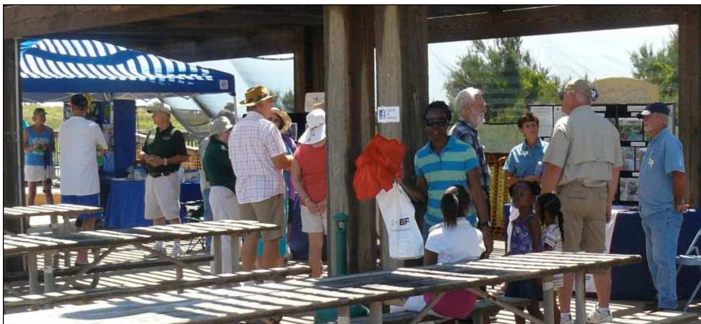
The Pavilion. Several local non-profit organizations, including Friends of Brazoria Wildlife Refuges, Texas Master Naturalist Cradle of Texas Chapter, and Gulf Coast Wildlife Rescue, shared exhibit space in the Pavilion.

More photos at: http://tinyurl.com/QBCP-30-Photos