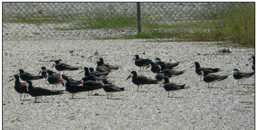
Four and twenty skimmers, facing toward the wind