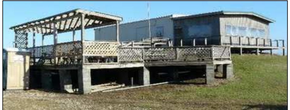
Chocolate Bayou Wildlife Conservation Center