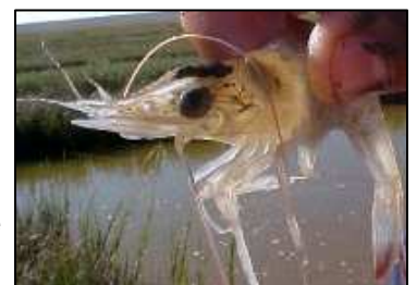
A shrimp caught in the seining net.