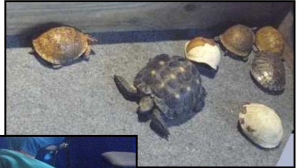
Above: A bale of turtles. [1]