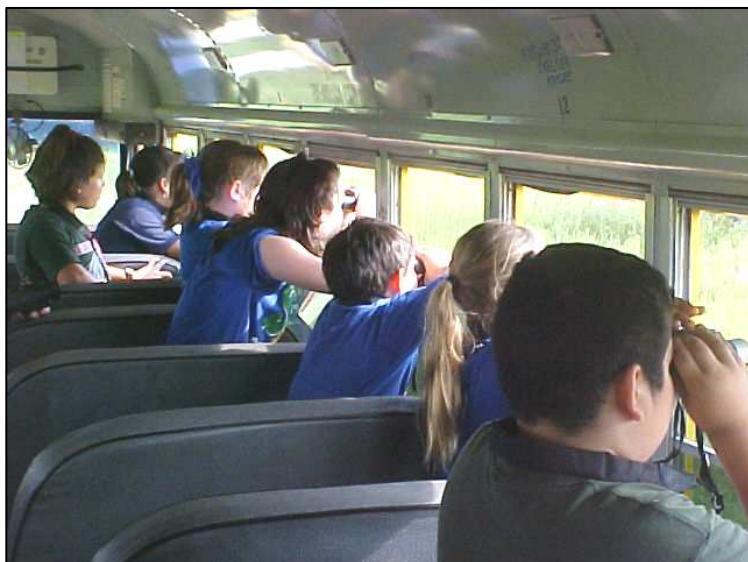
A bus ride through the refuge.