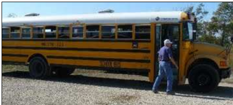
Bus driver, last on the bus at the end of the day,