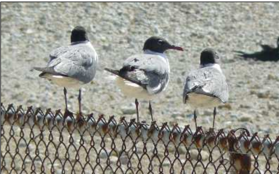
Laughing gulls, ever on the alert for an unattended egg or chick.