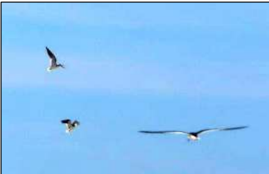
Skimmers in Flight