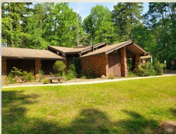
CLSP HQ after clean up. Amazing job, now waiting for plant approval from the state park.

"Going to the mountains is going home."— John Muir