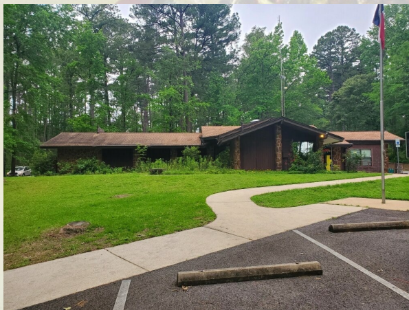
CLSP HQ before clean up.