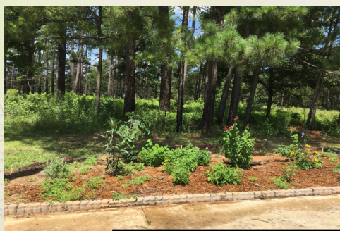
Equestrian Check-in — After