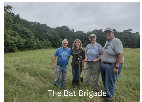
The Bat Brigade