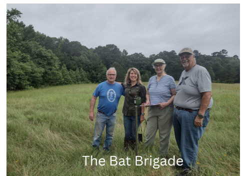
The Bat Brigade