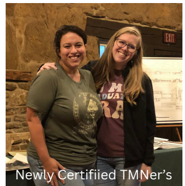
Newly Certified TMNer's