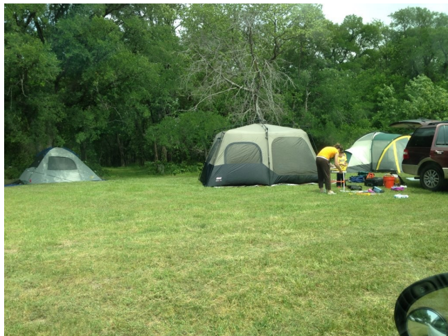
Setting up Campsites