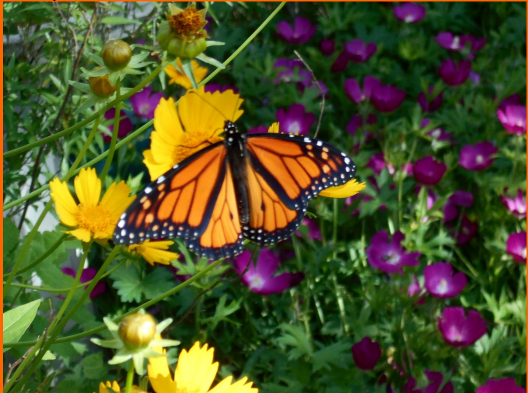
Monarch butterfly on Lance-leaf Coreopsis ( Coreopsis lanceolata )