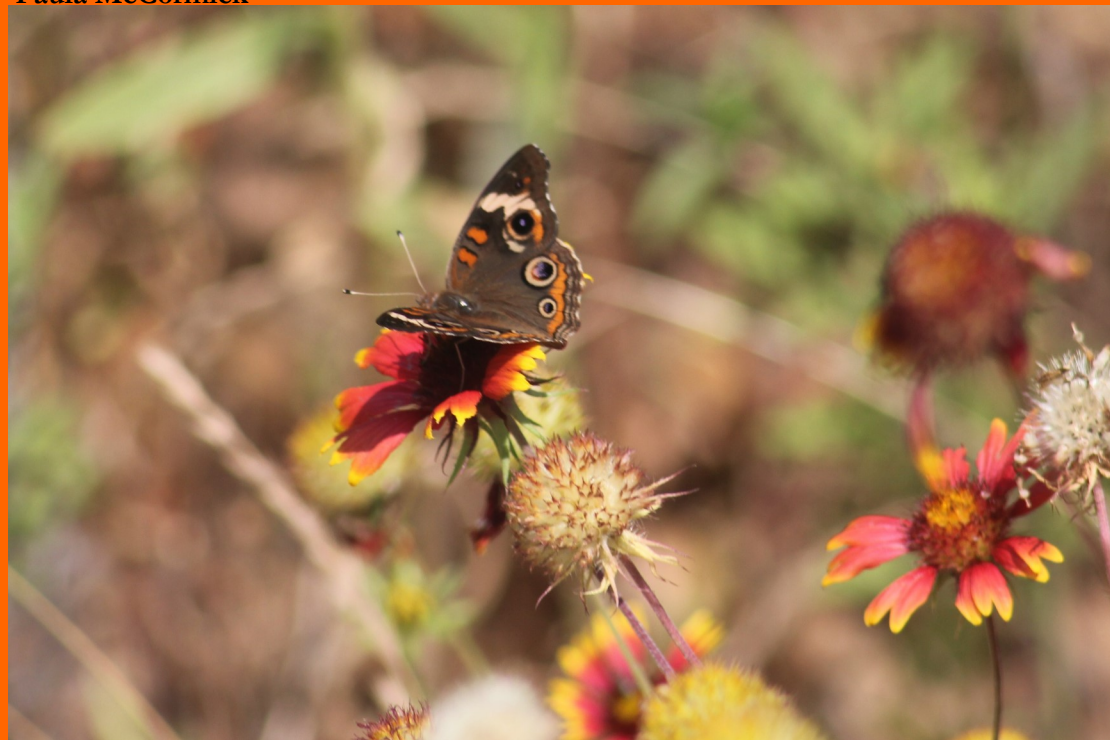
Buckeye on Indian blanket *See Note p. 16