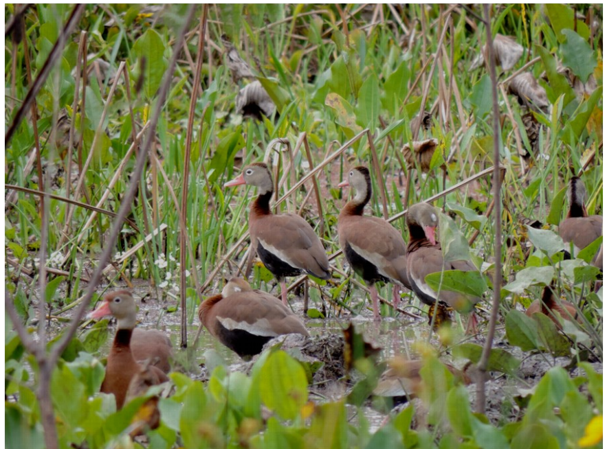
Black-bellied Whistling-Duck; Dendrocygna autumnalis

To find these large ducks with long necks and pink legs, follow the whistle calls. They have a chestnut and black body with a bright pink bill highlighting their gray face. Large white wing patches can be seen in flight.