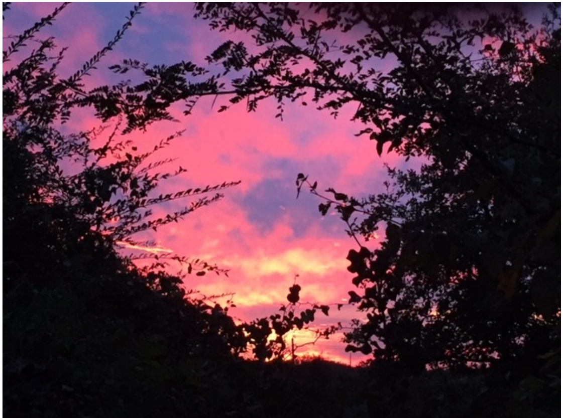
Sunset puts on a show— Dorothy Thetford