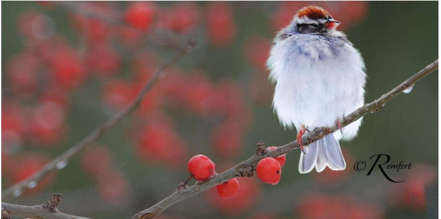
Chipping sparrow — From Gallery of Denise Remfert