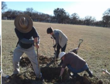
Digging a hole for our water oak