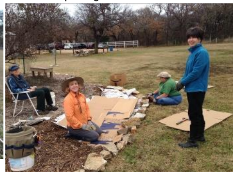
Expanding the monarch station