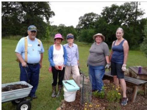
Monarch station work