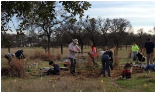
Digging holes for our Little blue stem rescue

Green Acres Farm Memorial Park 4400 Hide-A-Way Lane Flower Mound, TX 75022