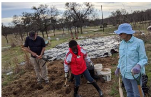
Preparing garden for Little Blue stem and hugelkulturs