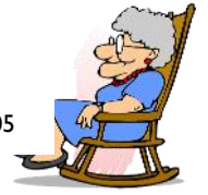
Editor, wanda odum, class 2005