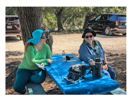
Members-in-Training resting in the shade after Gorge hike