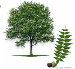
Texas Black Walnut

The 6 large trees will be Pecans, White Oaks, Cedar Elm and Anaqua. The 125 little trees will be Bur Oaks, White Oaks, Pecans, Eve's Necklace, Texas Redbuds and our own Black Walnuts. We collected the walnuts last year from Park West and Rick Ehlers Tree Farm raised them.