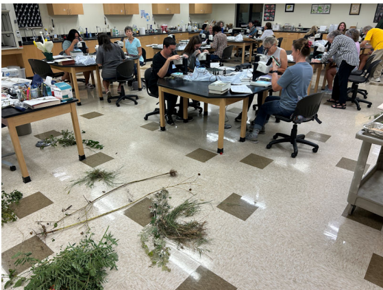
GMN class of 2025 at Moody Science Hall, TLU