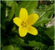
Lindheimera texana : Texas Star

Editor, The Texas Star 431 Timber Ridge Kerrville TX 78028