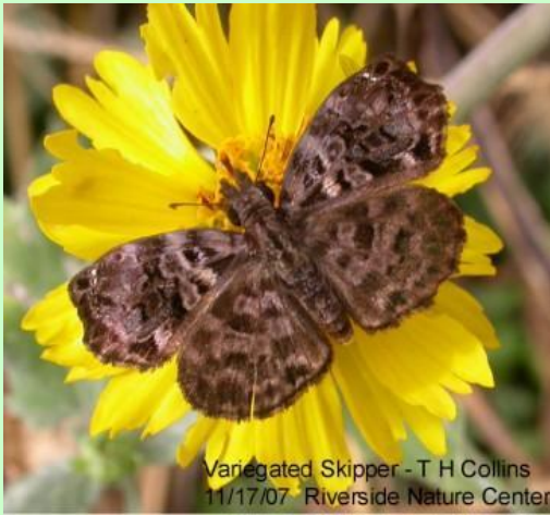
Variegated Skipper - 11/17/07 Riverside Nature Center

The Variegated Skipper is a Mexican species. It was a Kerr County record, the northernmost record for this species, and only the second time seen outside the Rio Grande Valley.