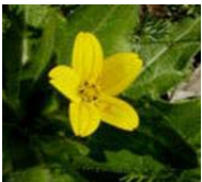
Lindheimeria texana : Texas Star