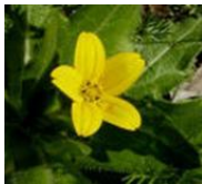
Lindheimera texana: Texas Star

Editor, The Texas Star 431 Timber Ridge Kerrville TX 78028