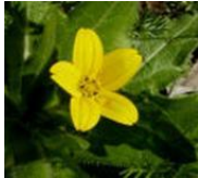
Lindheimera texana: Texas Star

Editor, The Texas Star 431 Timber Ridge Kerrville TX 78028