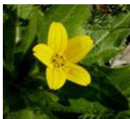
Lindheimera texana : Texas Star

Hill Country Master Naturalist Newsletter Editor 431 Timber Ridge Kerrville, TX 78028