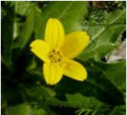
Lindheimera texana : Texas Star

Editor, The Texas Star 431 Timber Ridge Kerrville TX 78028