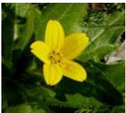
Lindheimera texana : Texas Star