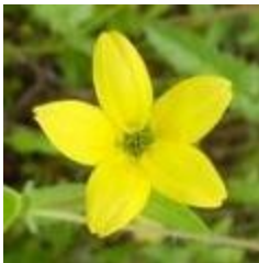
Texas Star Lindheimera texana

To develop a corps of well-informed volunteers to provide education, outreach, and service dedicated to the beneficial management of natural resources and natural areas within their communities.