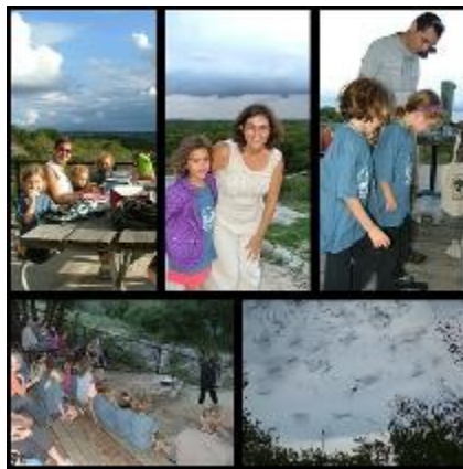
Families and volunteers gather at Old Tunnel WMA for a Family Field Trip. A beautiful evening, interpretive talk, and bat emergence were enjoyed.

As of the first week in February, these Junior Naturalist leaders have held nine classes per group (eighteen total) covering Texas' major ecoregions, stewardship, naturalist tools, ecosystems, herpetology, ornithology, mammalogy, ichthyology, entomology, geology, and hydrology. The remaining