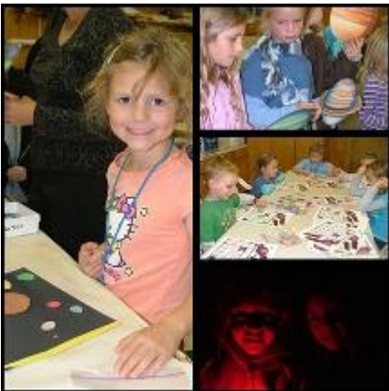
Families meet for a Star Party Field Trip at RNC. Kids had an asteroid program; parents had their own program.

three classes will cover seasons, weather, plants, and archaeology. We have had Family Field Trips to Old Tunnel Wildlife Management Area for an interpretive talk and bat emergence, and a Star Party at RNC focusing on asteroids.