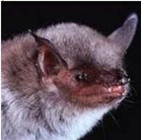
Cave myotis bat Myotis velifer Bandera County

Rare, Endangered, and Threatened in the four counties.