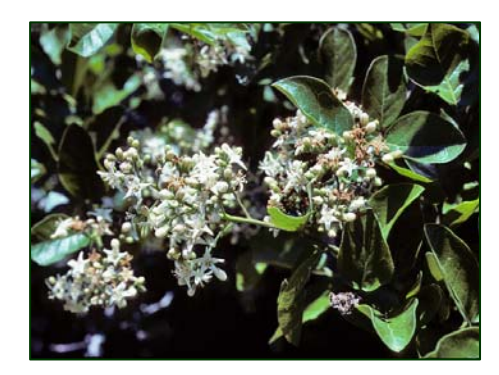
Close-up of Flower