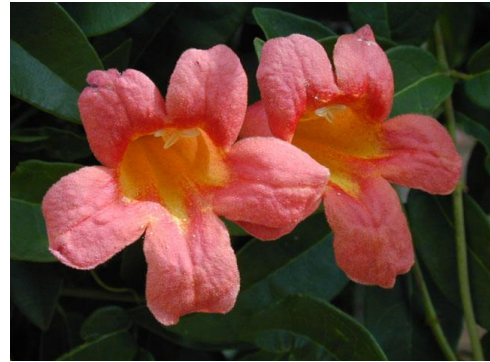
Crossvine Flower Detail