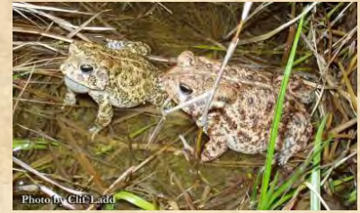
Male and female Houston toads

Optional Field Program at Bastrop State Park from 1:00 to 2:00 p.m.