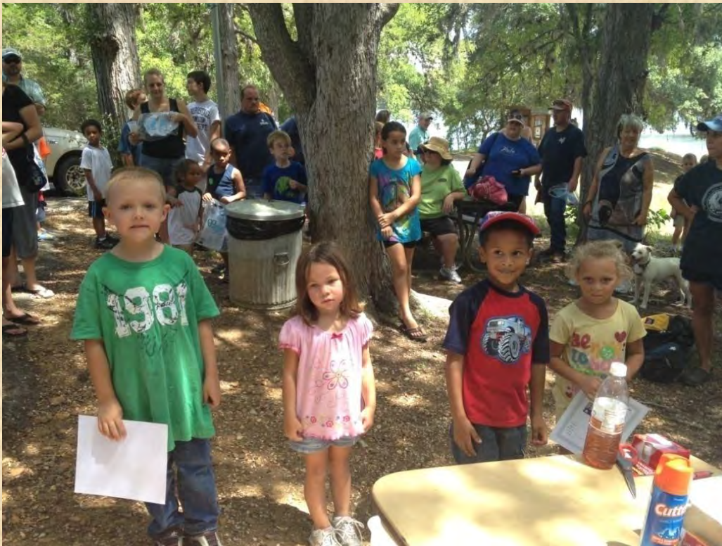
First Fish Certificates were presented to these four Fishers at the July 21 st Go Fish! event at Buescher State Park

Each event ended with a raffle for the kids at noon. We gave away tackle, tackle boxes, and rod and reel sets. Our grand prize winner won a kayak trip for three on the Colorado River. Rising Phoenix Adventures who has been a sponsor for all eight years of this program provided the prize. If you missed out on the fun had by all, don't fret, as the classes will be offered again during Spring Break and Summer 2013.