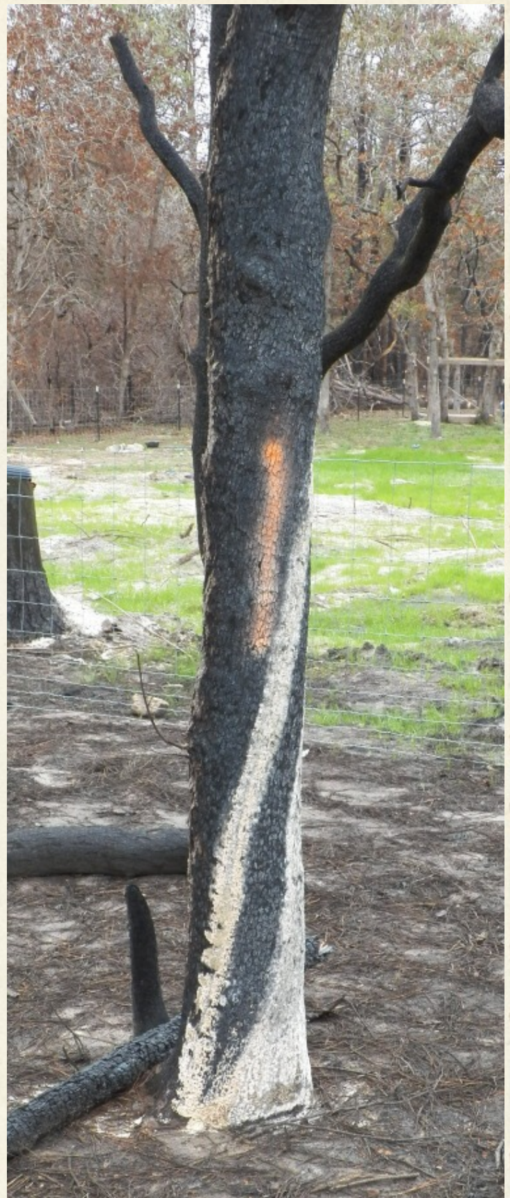
Burned tree in the Circle D area with white bacterial or fungal growth. Orange mark made by officials.