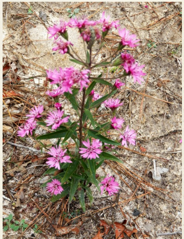
Image of Palafoxia sp. a wildflower common in sandy areas that grew up in a burned yard after the Bastrop Complex fire.