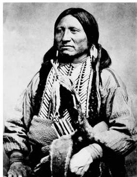
Kicking Bird also known as Tene-angop'te, "The Kicking Bird," or "Eagle Striking," and as Watoh-konk, "Black Eagle," was a chief of the Kiowa Native American tribe.

A tour around the park's new "Kicking Bird Trail"-named after a Kiowa Indian chief of that area, yielded several White-tailed Deer and Carolina Chickadee, Tufted Titmouse, Bewick's Wren, Harris' Sparrow, White-throated Sparrow, a singing Field Sparrow, Fox Sparrow, Northern Flicker, Cardinals and Mockingbirds in abundance, and Cedar Waxwing. Other birds seen were Black and Turkey Vulture, Eurasian Collared Dove, Barn Swallow, Purple Martin, Bobwhite and Eastern Bluebird.