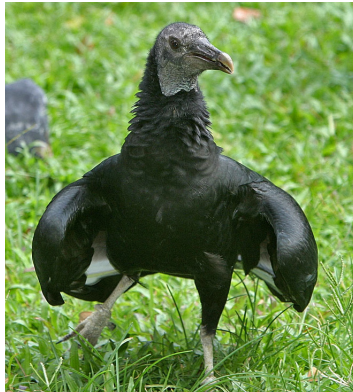
Above: An American Black Vulture. Right: A pair of Black Vulture eggs found at Fort Richardson State Park.

Vultures yielded a few observations that might be of interest. Vulture eggs are laid directly on bare ground, at the bottom of a stump or in a hollow log. Sometimes one but usually 2 eggs are laid. The eggs are about 3 inches. Both parents incubate for around 30 days. Young fledge between 70 and 90