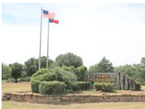
Entrance to Fort Richardson State Park just south of Jacksboro, Texas. The fort played a key role in the post-Civil War Texas Indian campaigns.

As we pulled in to the park headquarters we were greeted by ducks on the Quarry Lake: Shoveler, Red-head, American Wigeon, and Pied-billed Grebe.