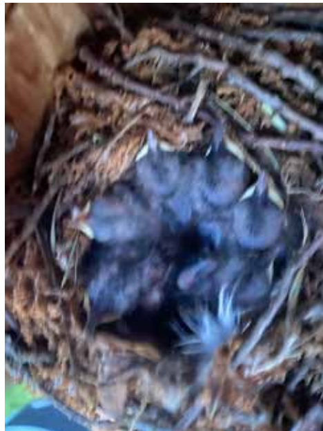
Wren nest with twigs & tassels