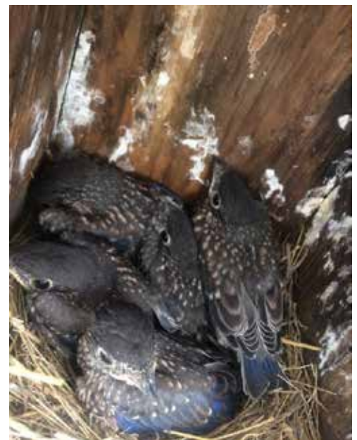
Baby bluebirds soon to fledge