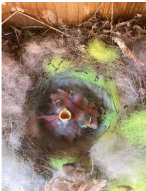
Titmouse hatchlings - April 2025