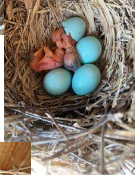
Baby bluebirds, just out of the shell