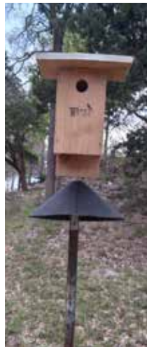
Examples of bluebird boxes used in the project