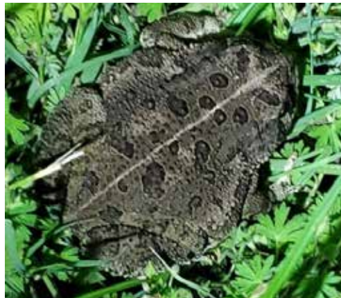
Woodhouse's Toad