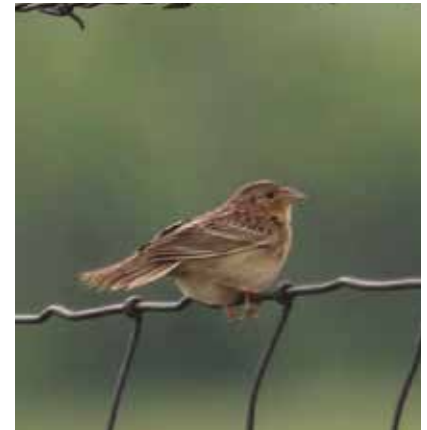
Grasshopper Sparrow