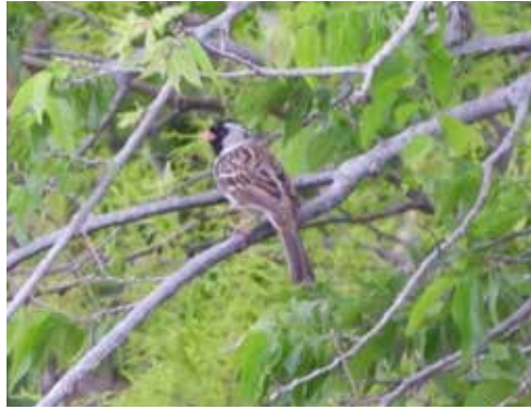
Harris's Sparrow