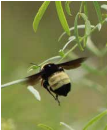
American Bumble Bee