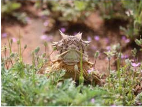
Horned Lizard

The City Nature Challenge is a global, city-scale urban biodiversity BioBlitz framed as a friendly competition between participating areas.