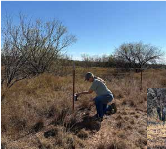
Fall at Three Rivers Ranch