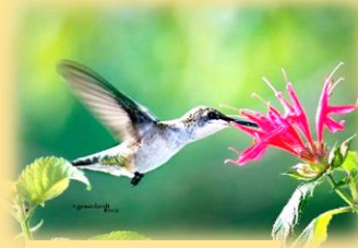
T. Geneinhardt 2016

Hummingbirds feed on the nectar of flowering plants and are especially attracted to red tubular flowers. We can attract hummingbirds to our yards by planting nectar producing plants in our home landscaping.