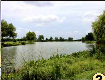
2 Seabourne Lake