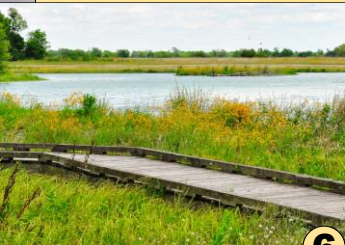
6 Wetlands Pond