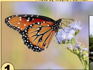
1 Butterfly Garden