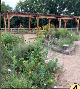
4 Native Plant Garden