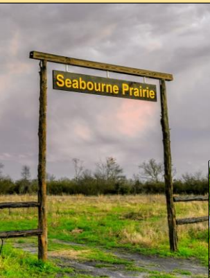
5 Prairie Restoration Area