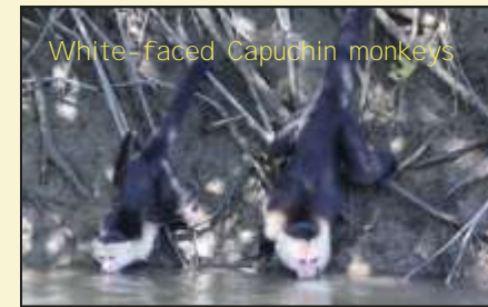
White-faced Capuchin monkeys

hear and see them near the beach as well as high up in the cloud forests.