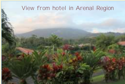
View from hotel in Arenal Region

Tortuguero is also home to the sea turtles who come there to lay their eggs. The primary nesting season is in Au-