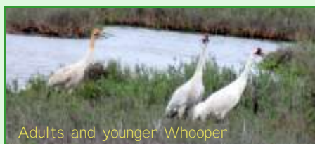
Adults and younger Whooper

The birds were a bit more spread out this year, although we're told their numbers are holding (at approximately 300), so we weren't able to get as close to them as in the past. However, our patience was rewarded finally with a nice viewing of an adult pair with a juvenile offspring. The offspring are nearly as large as their parents by now but their feathers are mottled brown and white in contrast to the solid white plumage (except for black wing tips) of their parents. It was difficult to tear ourselves away from these three happily feasting on creatures they plucked from the shallow waters but we returned to land and continued our