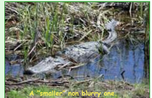
A "smaller" non blurry one.

We needed to get back to the car, so we climbed down and with newly aroused senses and keen awareness of our surroundings, started the trek back. We cautiously approached the section of path adjacent to the beast and spied his gigantic gnarly head poking out of the grass - I high-tailed it on down the trail with Dan not far behind! As we continued on our way, we became aware of