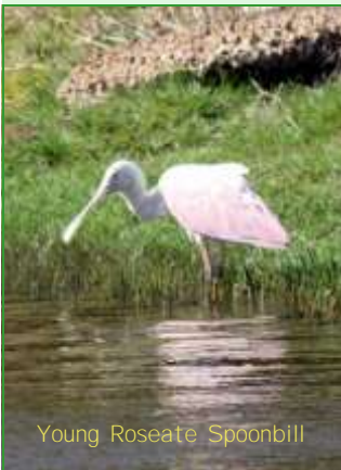
Young Roseate Spoonbill

This time of year brings excitement and anticipation for me as I know the Whooping Cranes will now be in Texas - close enough for me to personally witness their awesome grace and beauty. They travel from Canada with their youngsters to hang out in the area of the Aransas National Wildlife Refuge for the summer, feasting on their favorite meal, the blue crab - if they can get it. This year blue crab is scarce due to recent drought conditions