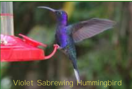
Violet Sabrewing Hummingbird

But, of course my favorite part was the birds. There are more species of birds in Costa Rica than in all of North America and the land mass is only about the size of West Virginia! Everyone there is a birder. Our guide and our bus driver both have experience leading birding tours. How lucky can you get!