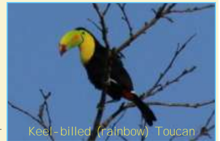
Keel-billed (rainbow) Toucan

The river is home to caimans, toucans, parrots, jacanas, collared aricaris, and three species of monkeys: Howlers, Spider, and White-faced capuchins. The locals call them Cappuccinos." Every morning and often in the afternoon the Howlers set up a din that reverberates all through the forests. They are widespread so you