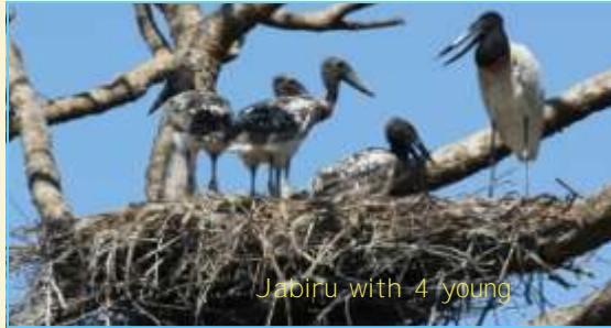
Jabiru with 4 young

pillar. There are many species of bats in Costa Rica but these were the only ones we saw in the wild.