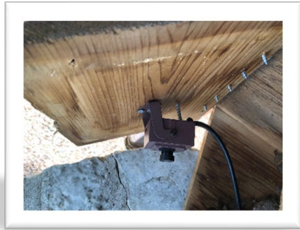
View of owl cam mounted inside box lid