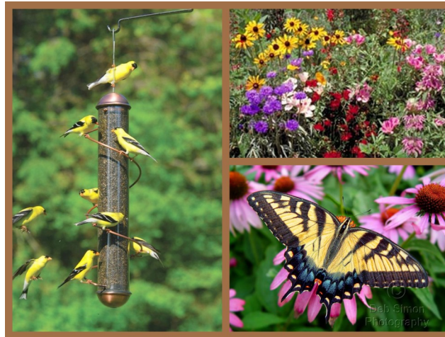
The Nature of Milam County

The special nature of Milam County shows up on a soil map. Blackland Prairie to the North and West, and Post Oak Savannah to the South and East—the way the ocean left us millions of years ago. Join us to help care for it.