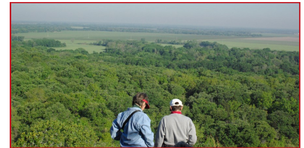
View from Sugarloaf Mountain