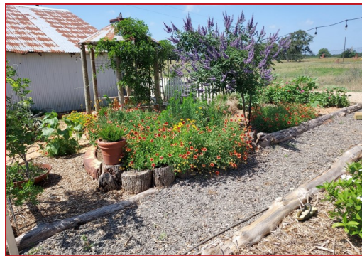
B&B Farm Wildscape