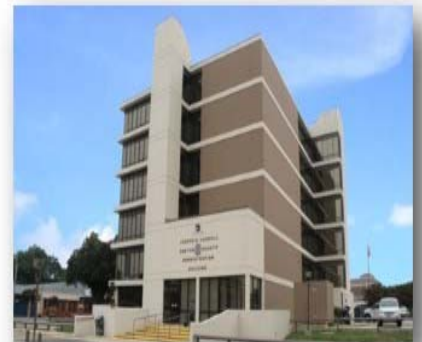
Carroll Courts Bldg. 401 W. Hickory Denton