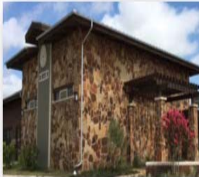
Southwest Courthouse 6200 Canyon Falls Dr Flower Mound