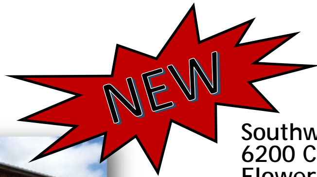
Southwest Courthouse 6200 Canyon Falls Dr Flower Mound