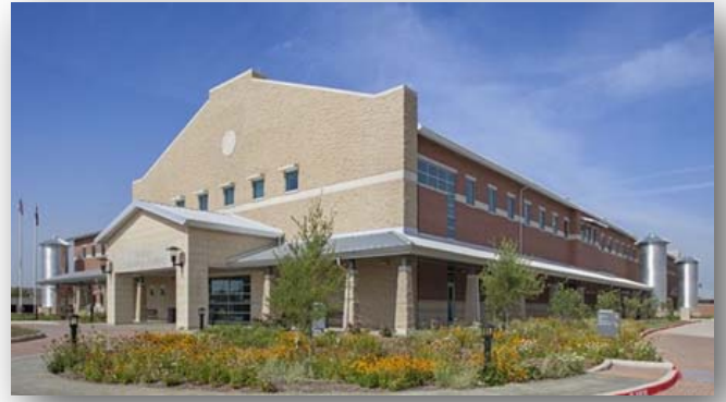
DCAC Technology and Elections Bldg 701 Kimberly Drive Denton