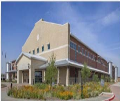
DCAC Technology and Elections Bldg 701 Kimberly Drive Denton

Jan 18 – Elections Bldg Feb 15 – Southwest Courthouse *Annual Awards Meeting* Mar 15 – Southwest Courthouse Apr 19 – Southwest Courthouse May 17 – Southwest Courthouse Jun 21 – Southwest Courthouse Jul 19 - Elections Bldg *Open House* room available from noon to 5:00pm, Wednesday, Jul 18, for set-up Aug 16 – Elections Bldg Sept 20 – Southwest Courthouse Oct 18 – Southwest Courthouse Nov 15 – Elections Bldg Dec 13 – Elections Bldg *Holiday Party* room available from noon to 5:00pm, Wednesday, Dec 12 for setup. Holiday Party begins at 10:00 A.M.