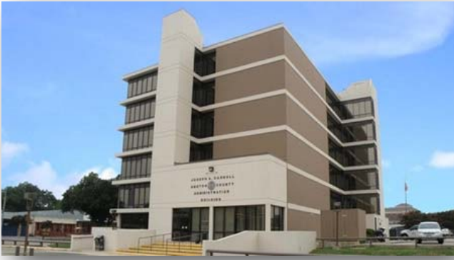
Carroll Courts Bldg. 401 W. Hickory Denton