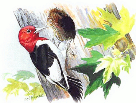
Red Headed Woodpecker

A lthough once prolific, the woodpeckers are no longer in the tree outside her bedroom where she could hear them busily pecking away!