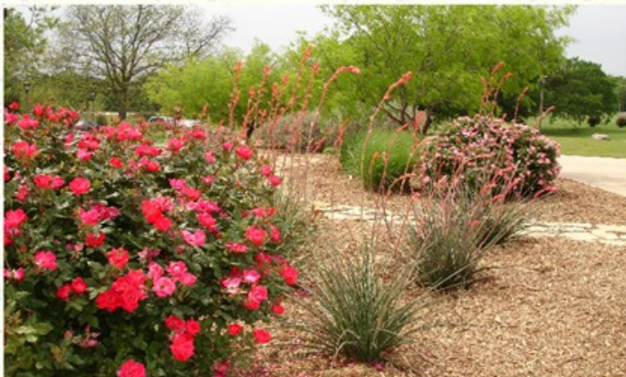
Suggested Plants for Hill Country Style Garden

If you have additional questions, please feel free to contact me: pohlensusan@gmail.com or call 940 686-5739 .