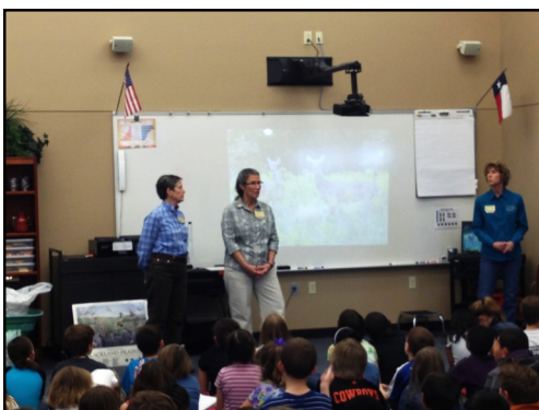
Our 3 presenters fielding questions

Some of the students' questions went like this: