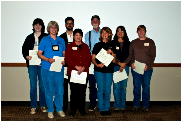
2012 CLASS RECEIVING INITIAL CERTIFICATION AWARDS — 12 PARTICIPANTS