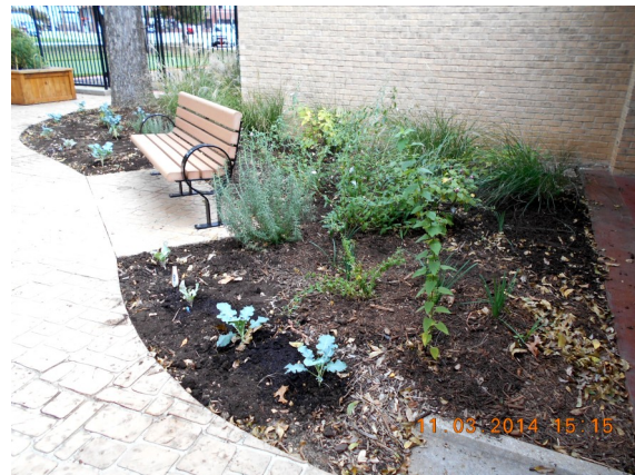
In the garden