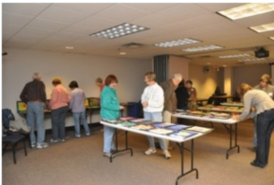
Working the room