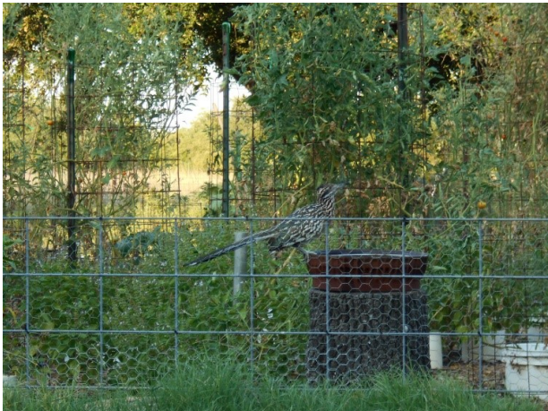
9 Looks like a good place to wet my whistle & get my feet wet.