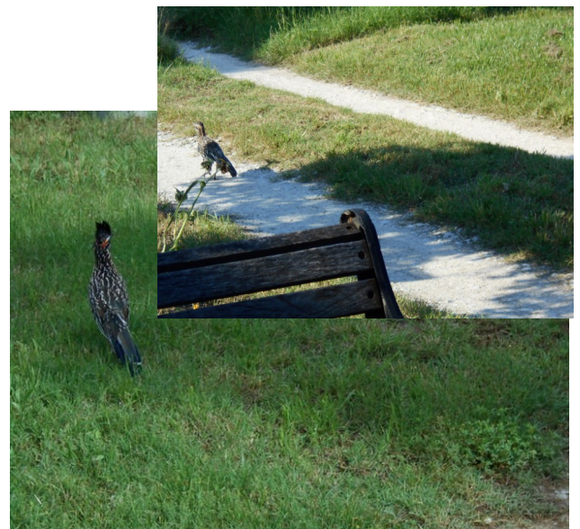
12 See you later—more adventures to be had, but I'll be back.