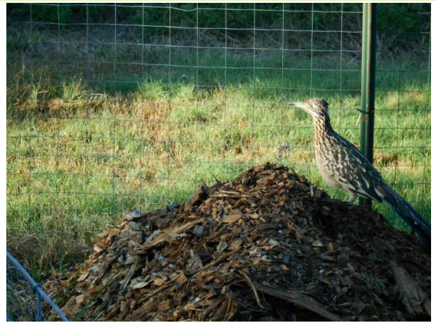
8 Let me see. A lizard or two maybe, topped off with a few insects.