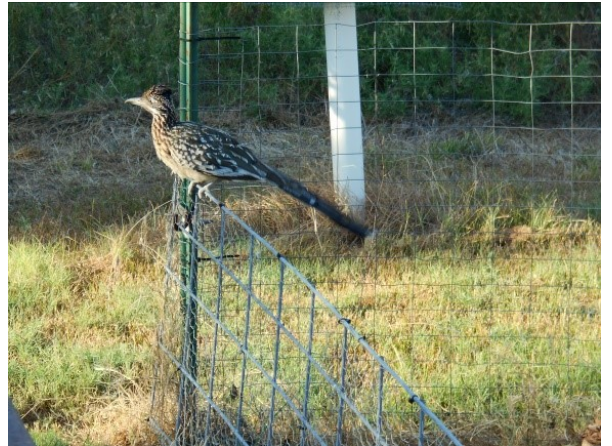
10 Verry satisfying. Must come back again and bring the family.