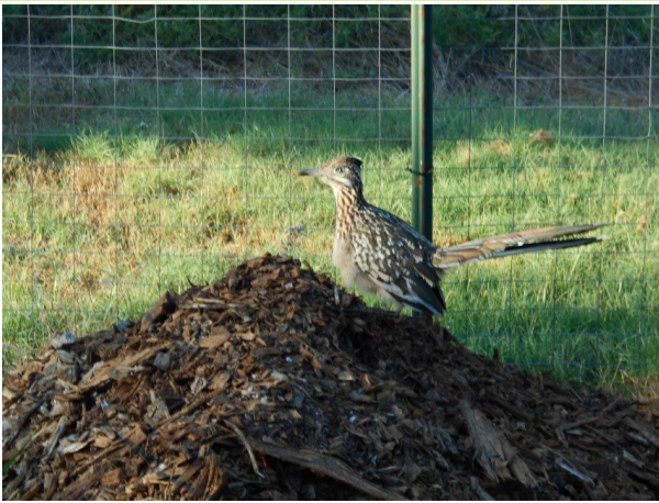
7 Here's a nice looking heap. Worth a try.