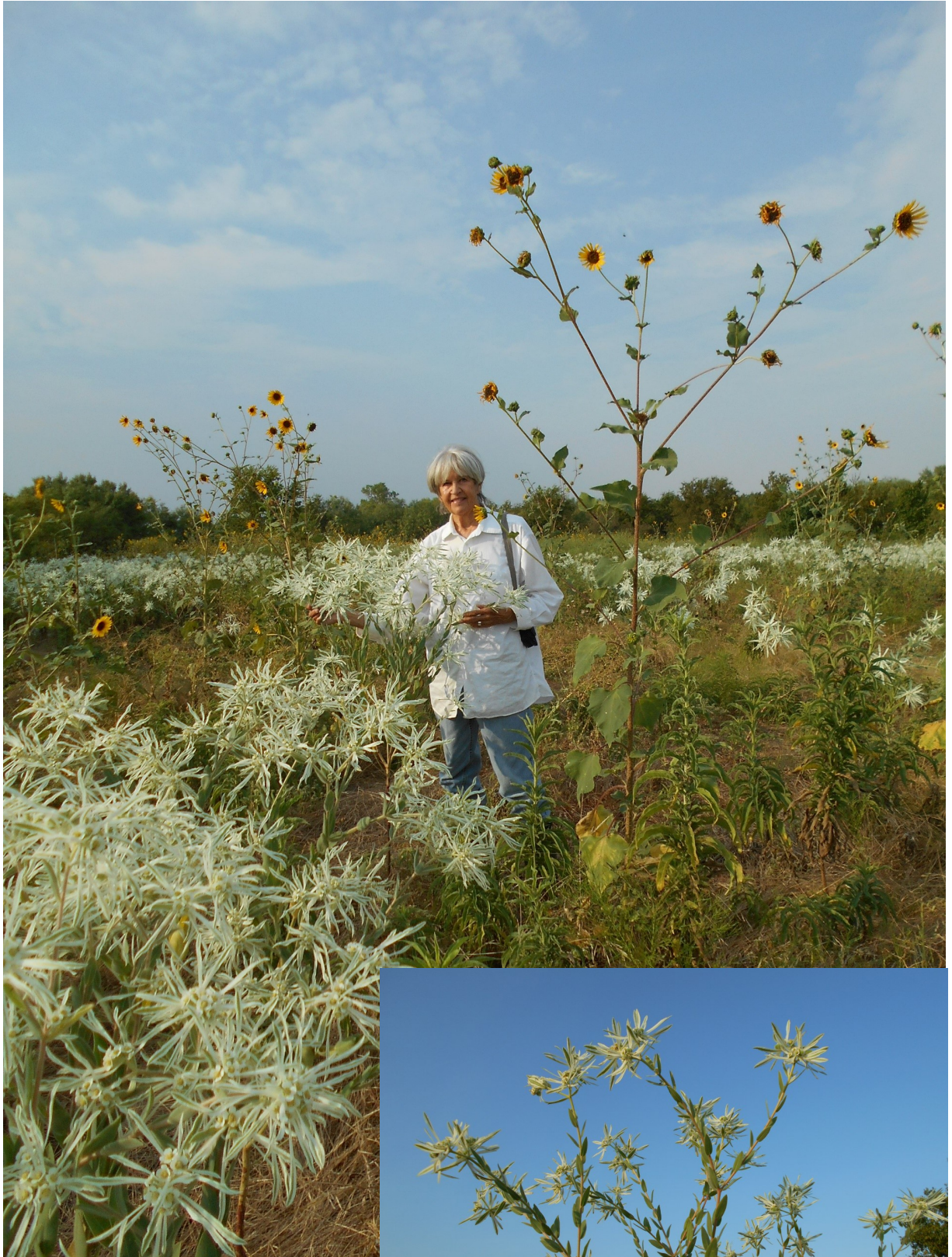
Height of plant in perspective along-side author 5'6" tall